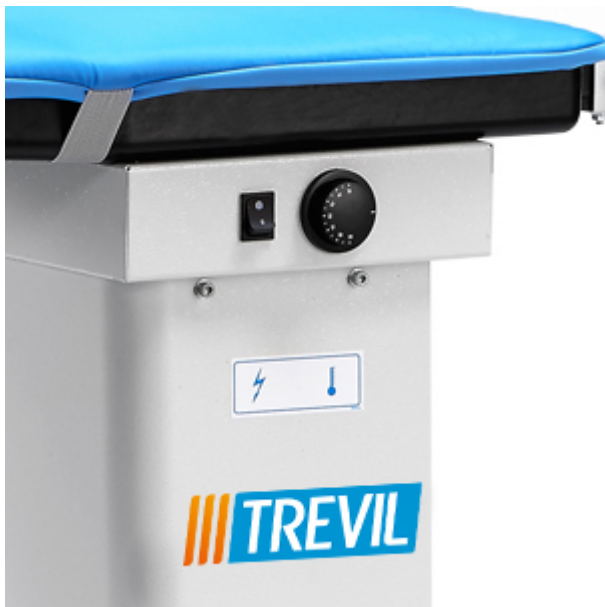
Adjustment of surface temperature